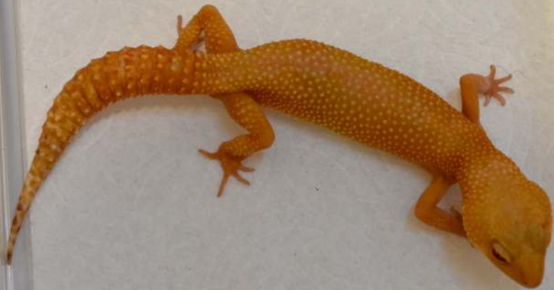
#24 Blood Sunglow, Female: $250 My best sunglow female