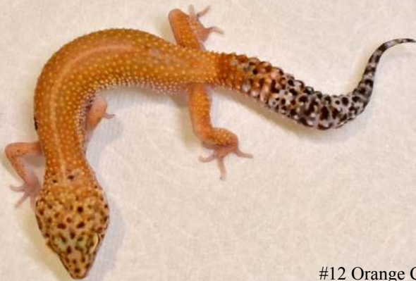
#12 Orange Crush, Female: $100 JMG original