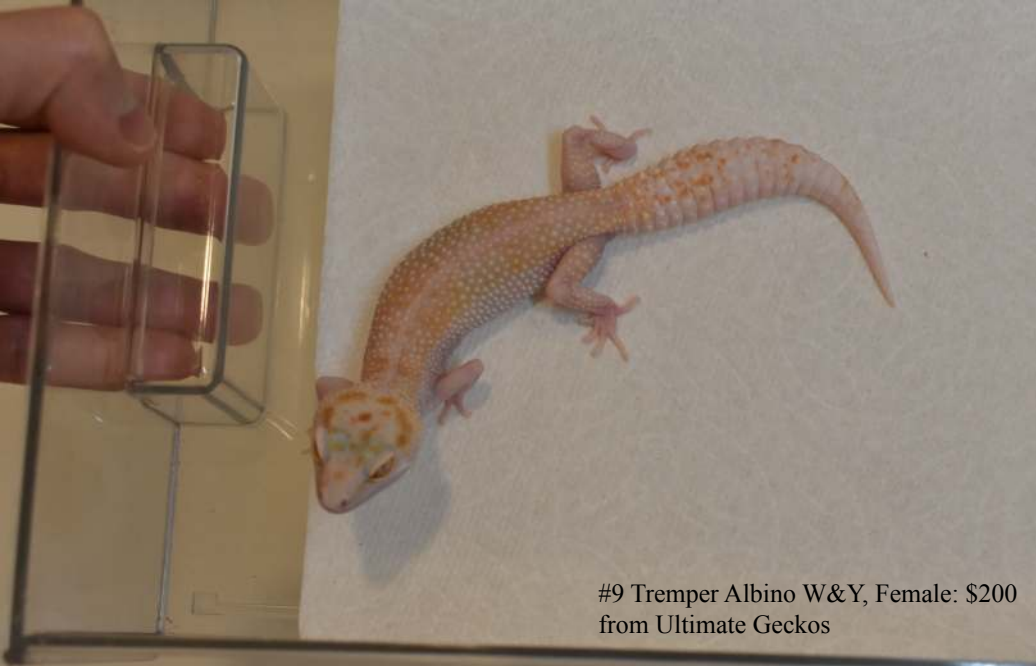
#9 Tremper Albino W&Y, Female: $200 from Ultimate Geckos