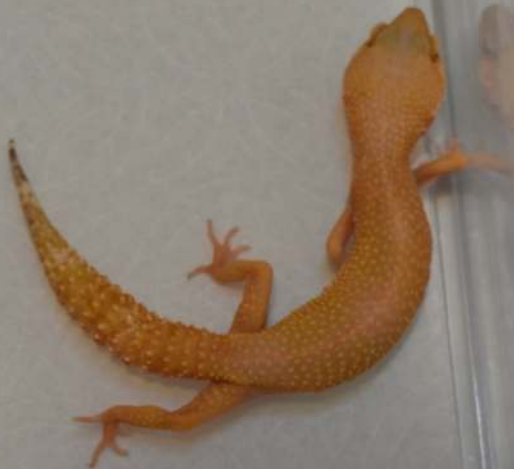
#32 Electric Sunglow, Female:$150 Recovering after laying an unfertilized egg on 11/07/23