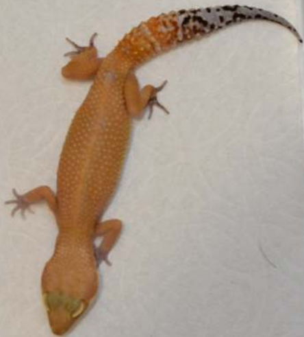
#14 Black Blood, Female: $250