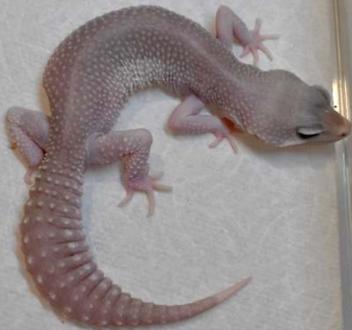
#2 Galaxy Blizzard het 100% Bell Albino, Female: $250