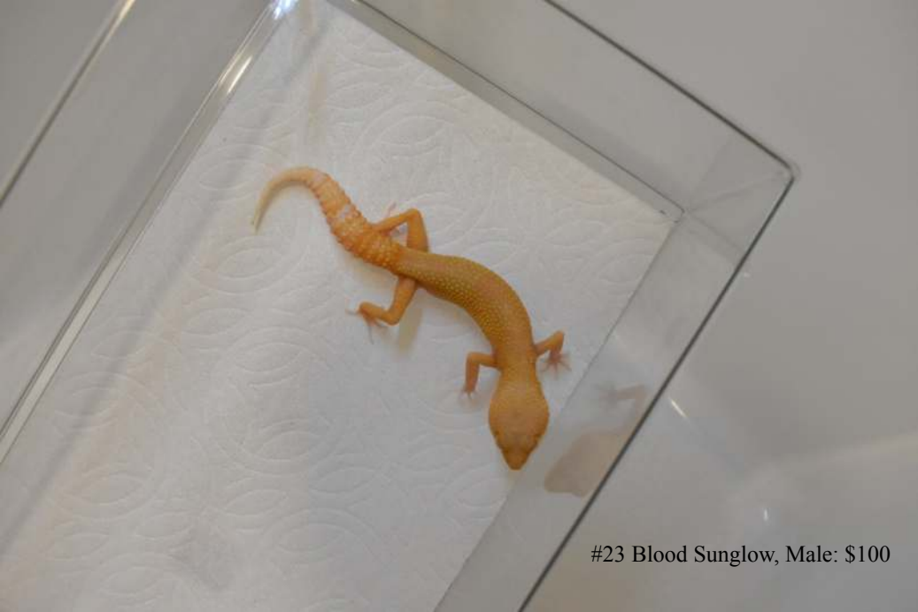
#23 Blood Sun glow, Male: $100