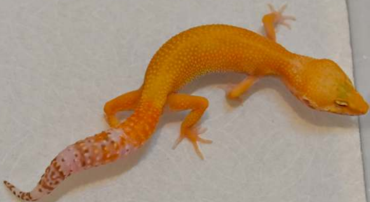
#51 Super Tangerine Bell Albino, Female: $150 Good color, but her eyes have genetic issue (Assuming its from line breeding)