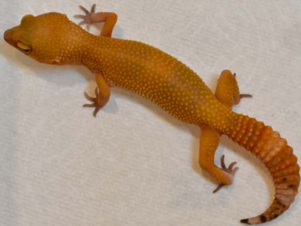
#30 Mandarin Tremper, Female: $250