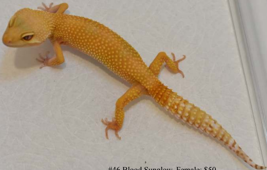
#46 Blood Sungecko, Female: $50 Recovering but it will take at least a month