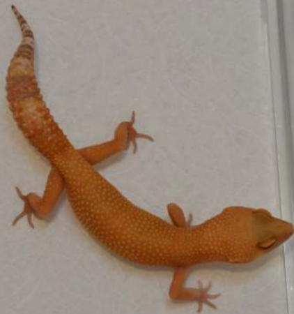
#33 Blood Sunglow, Female: $250 Gorgeous body color