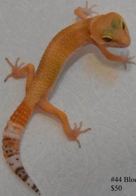
#44 Blood Sunglow, Female: $50