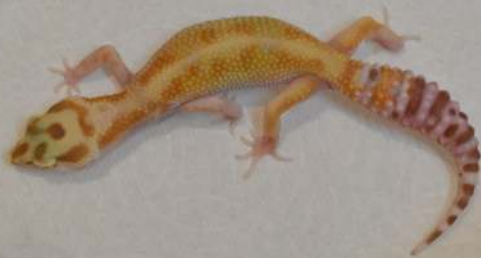
#5 Bell Albino W&Y, Female: $200