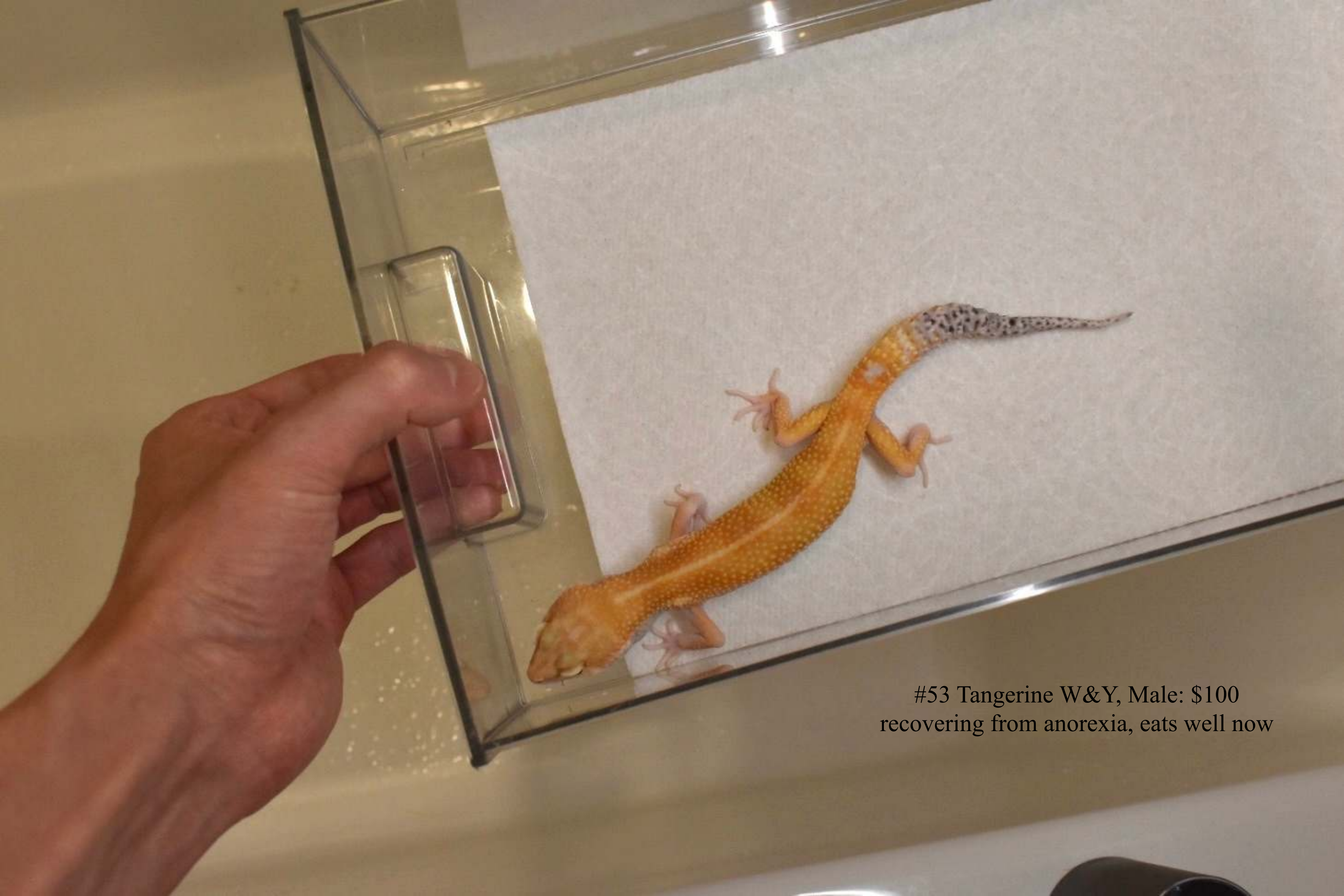
#53 Tangerine W&Y, Male: $100 recovering from anorexia, eats well now