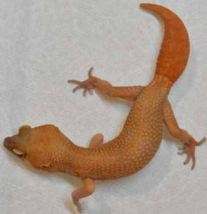
#18 Blood Sungecko, Male: $200 Top quality, Stubtail