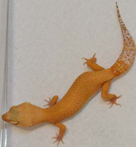
#37 Blood Sungecko, Female: $100