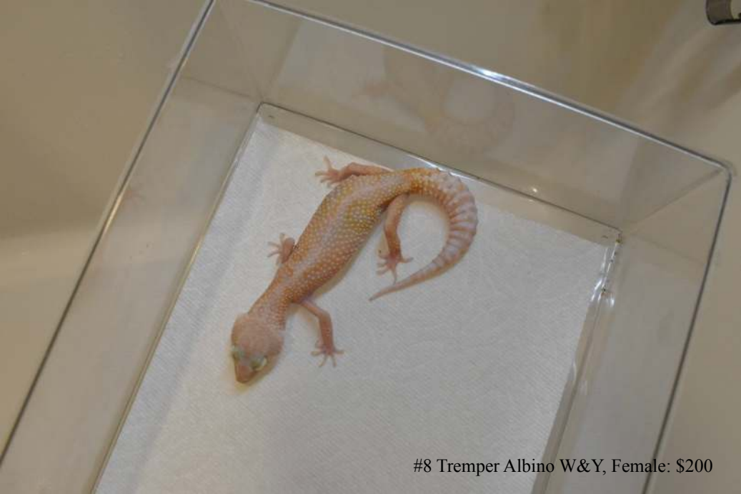
#8 Tremper Albino W&Y, Female: $200