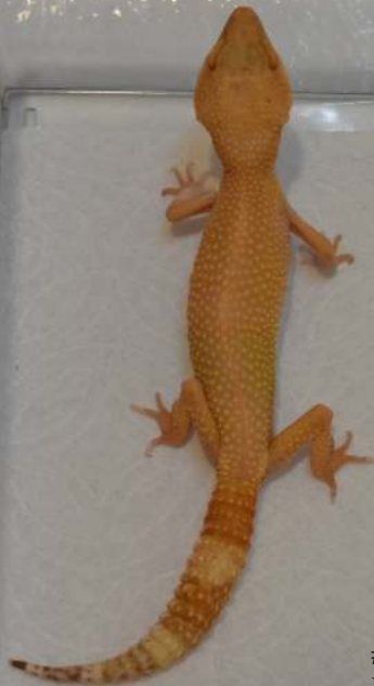
#43 Electric Sun glow, Female: $150 Recovering