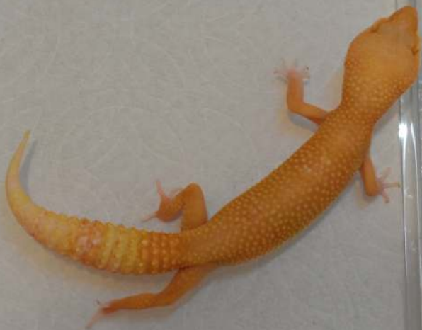
#26 Blood Sun glow, Female: $200