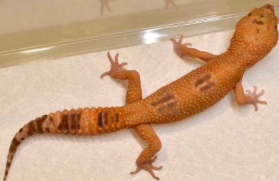
#54 Blood Sunglow, Male: $200