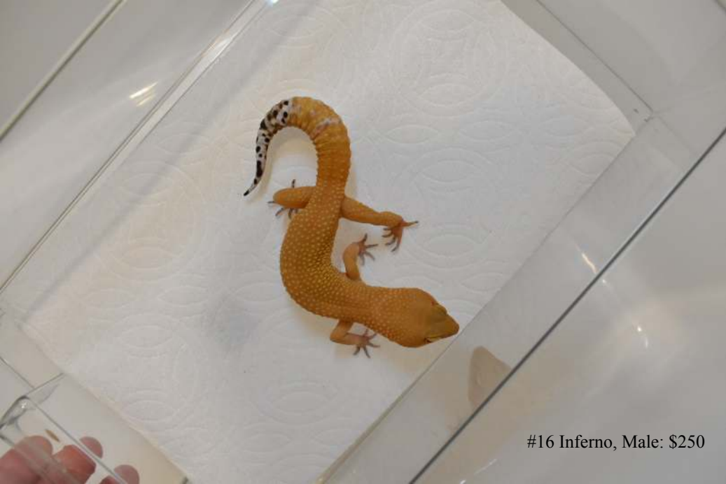
#16 Inferno, Male: $250