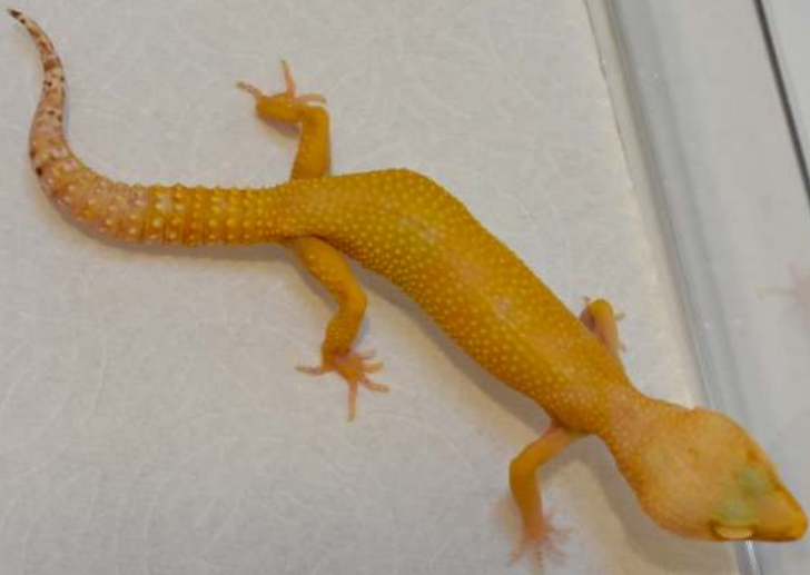
#52 Super Tangerine Bell Albino, Female: $100 Original STB from Electric Gecko, proven breeder I would say she's equivalent of Bell Sunglow