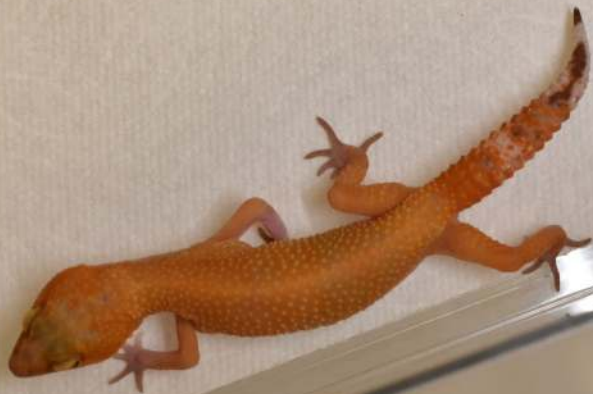
#29 Mandarin Tremper, Female: $200 Shorttail