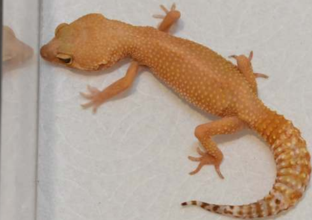
#36 Electric Sun glow, Female: $50 Born with hip dysplasia