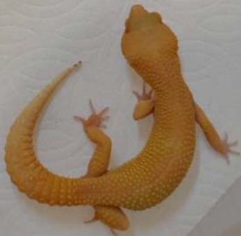
#48 Super Tangerine Bell Albino, Male: $300 Original STB from Electric Gecko, proven breeder