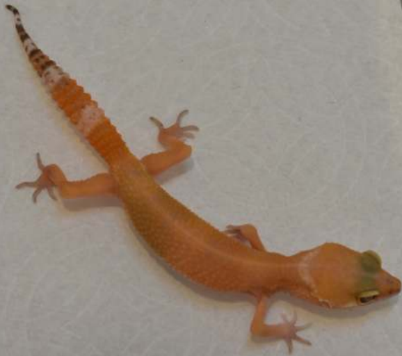
#42 Blood Sungecko, Female: $50