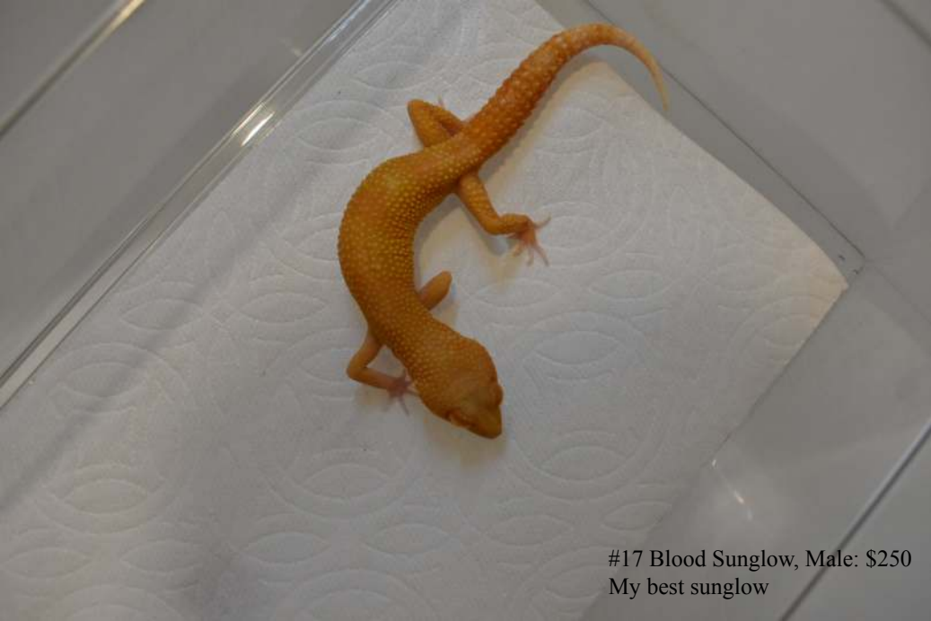
#17 Blood Sunflow, Male: $250 My best sunglow