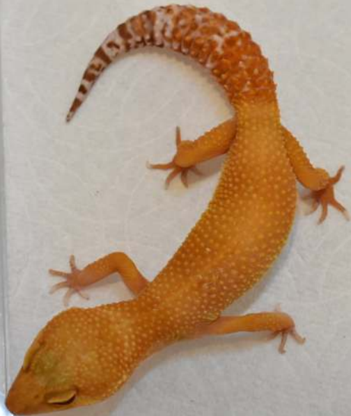
#34 Blood Sunglow, Female: $200