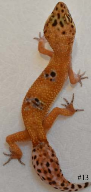
#13 Purple Head Tangerine, Female: $200 Stubtail