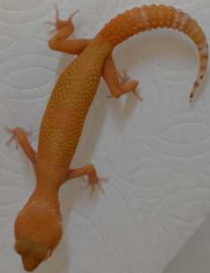
#49 Super Tangerine Bell Albino, Male: $300 Better than his dad above