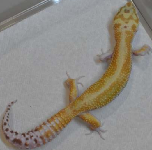
#4 Bell Ablino W&Y, Male: $200 Proven Breeder