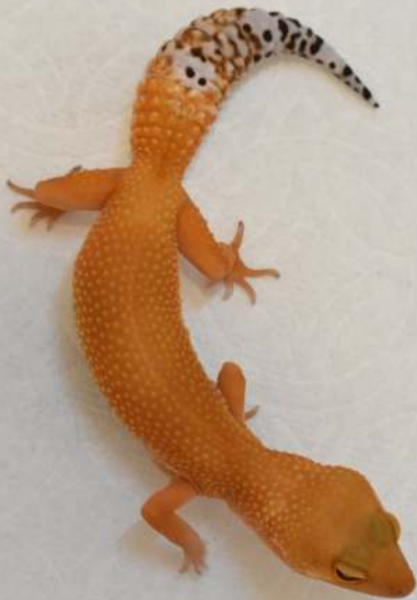
#11 Mandarin, Female: $250 Great body color