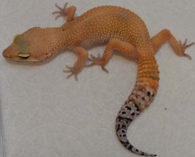
#15 Black Blood X Charcoal , Female: $250