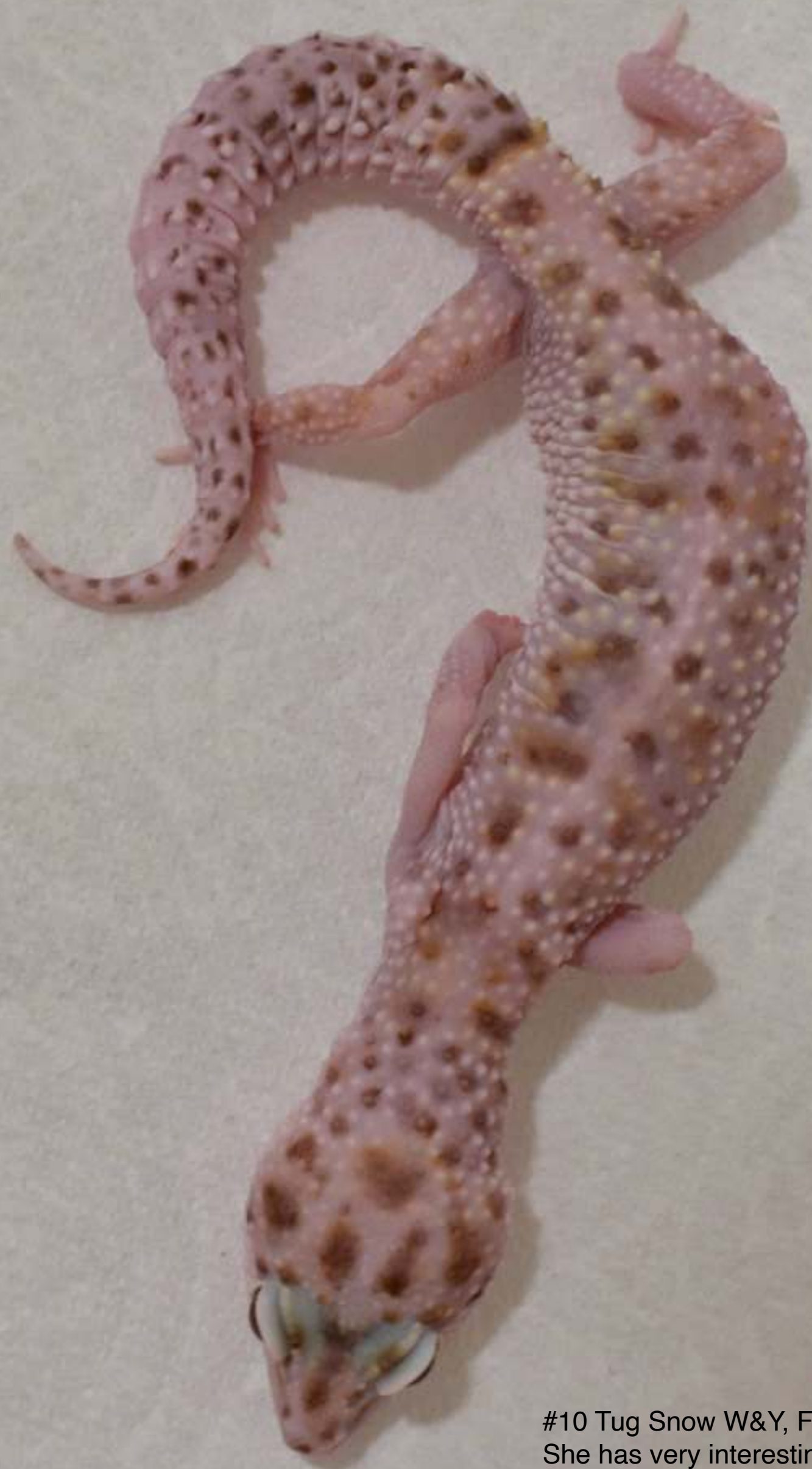
#10 Tug Snow W&Y, Female: $200 She has very interesting eyes, they look like crystals