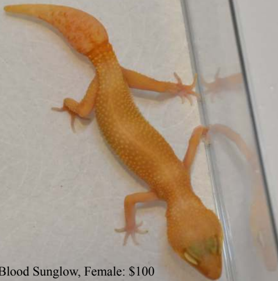
#38 Blood Sungecko, Female: $100 Stubtail