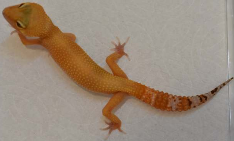
#39 Blood Sungecko, Female: $50