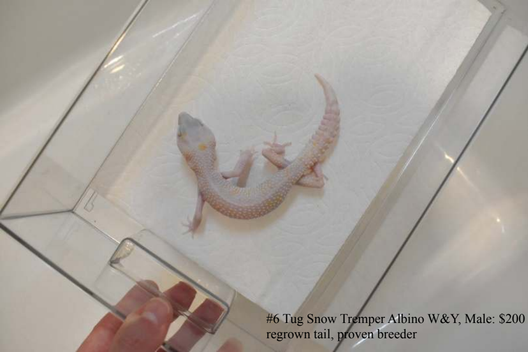
#6 Tug Snow Tremper Albino W&Y, Male: $200 regrown tail, proven breeder