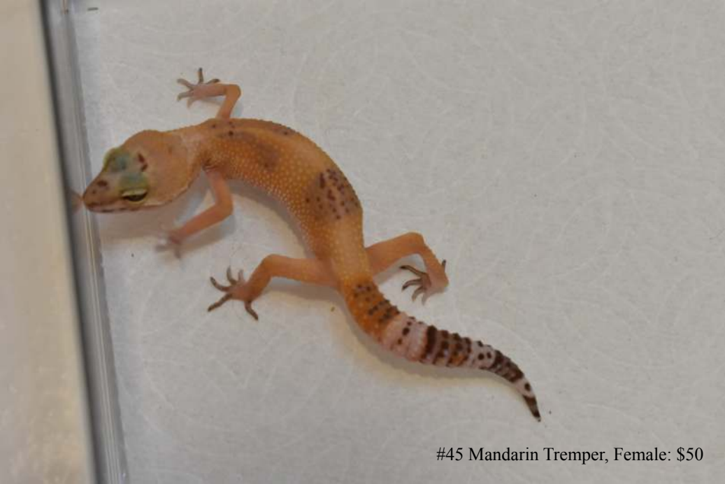
#45 Mandarin Tremper, Female: $50