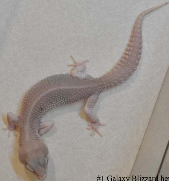
#1 Galaxy Blizzard het 100% Bell Albino, Male: $250