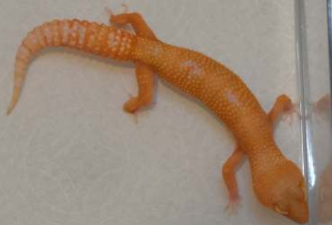
#27 Blood Sunglow, Female: $250 Hurt one of her back legs when she was a hatchling