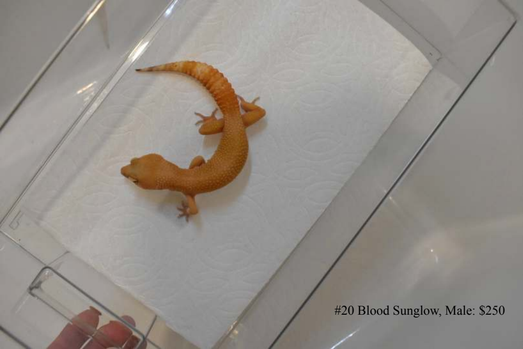
#20 Blood Sunglow, Male: $250