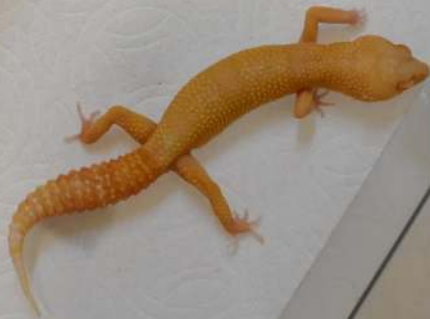
#21 Blood Sunflower, Male: $250 Proven Breeder