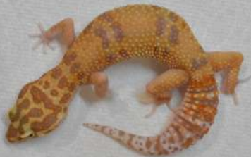
#7 Tremper Albino W&Y, Female: $200