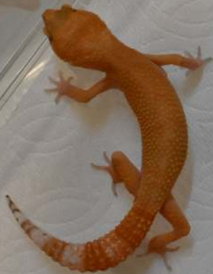
#19 Blood Sungecko, Male: $250 Top quality