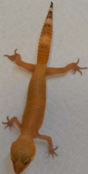
#41 Blood Sungecko, Female: $100