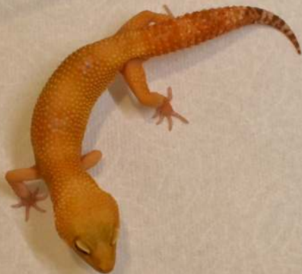
#55 Blood Sunglow, Male: $200