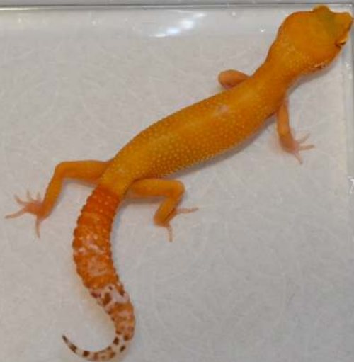
#50 Super Tangerine Bell Albino, Female: $200