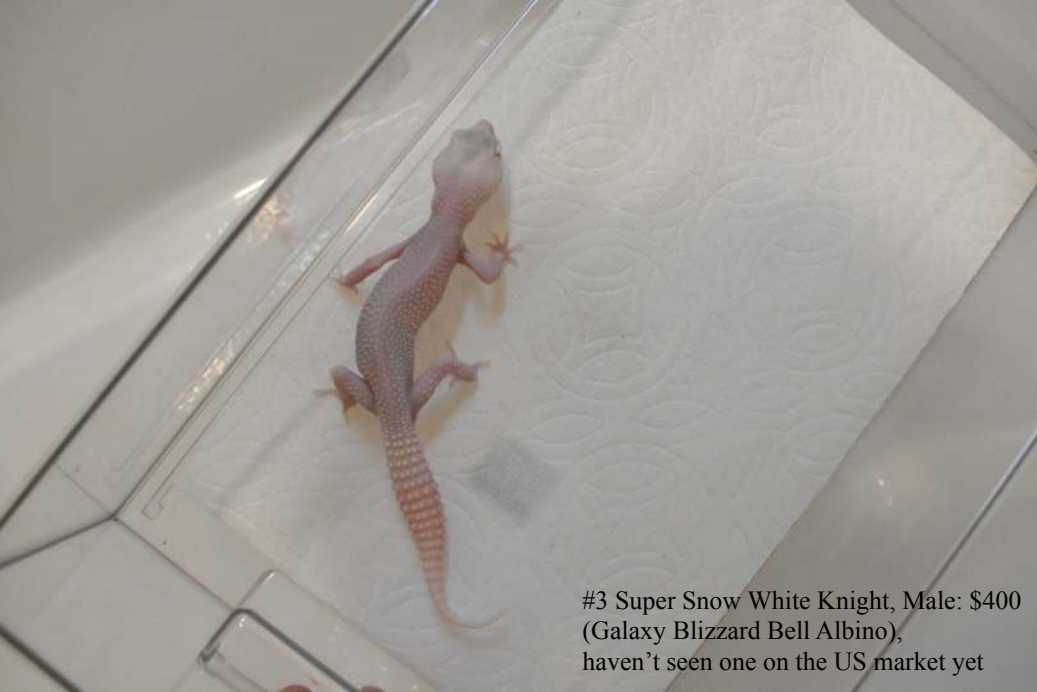
#3 Super Snow White Knight, Male: $400 (Galaxy Blizzard Bell Albino), haven't seen one on the US market yet