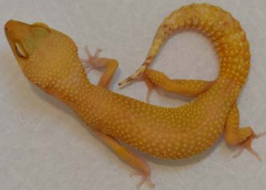
#35 Electric Sun glow, Female: $150 She will recover her true color