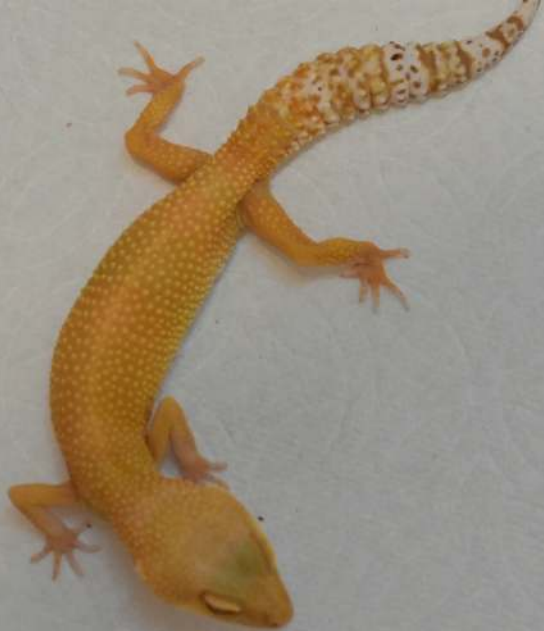
#47 Blood Sungecko, Female: $100