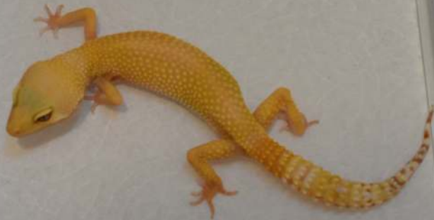
#40 Blood Sungecko, Female: $50 Recovering but it will at least take a month