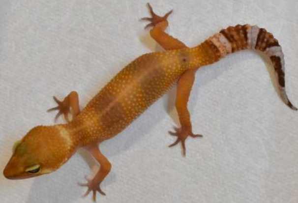
#31 Mandarin Tremper, Female: $100