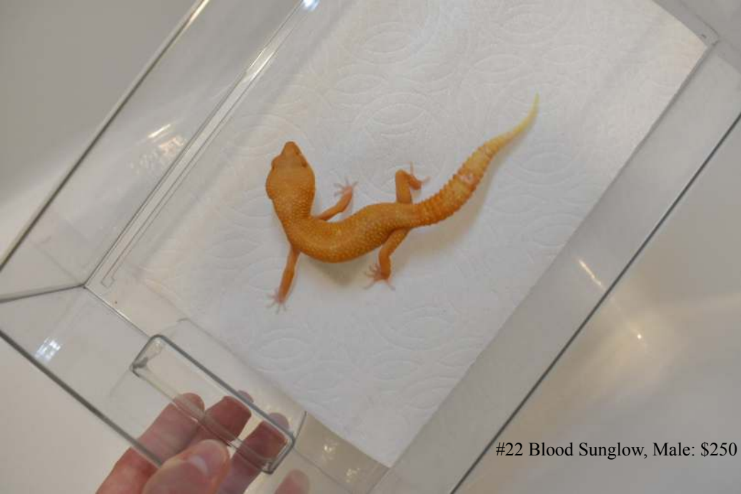
#22 Blood Sunglow, Male: $250