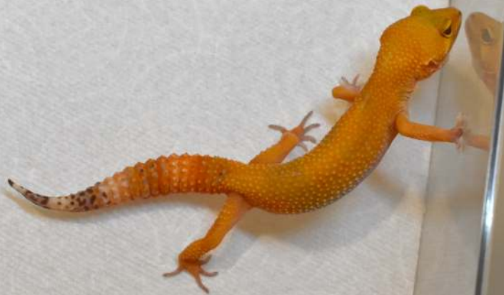
#25 Blood Sungecko, Female: $200