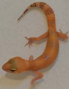
#28 Blood Sungecko, Female: $100